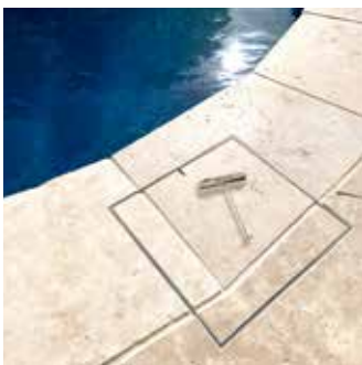
SKIMMER BOX COVERS