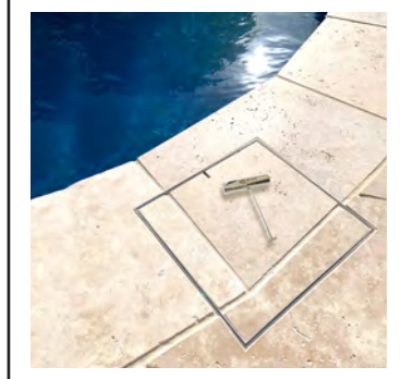
SKIMMER BOX COVERS