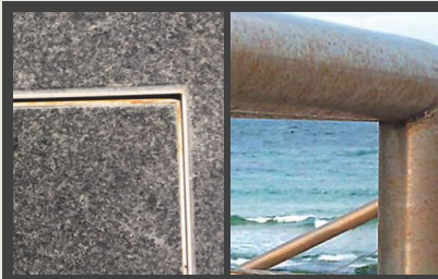
Photo showing 'Tea Staining' on Stainless Steel.

All you need is a nylon scourer, soapy water, and a little elbow grease to clean the surface.