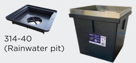
314-40 (Rainwater pit)